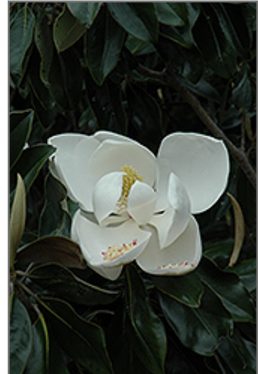
D.D. Blanchard Magnolia flowers