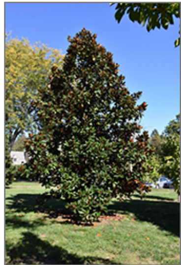
D.D. Blanchard Magnolia