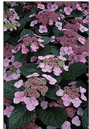
Tokyo Delight Hydrangea flowers