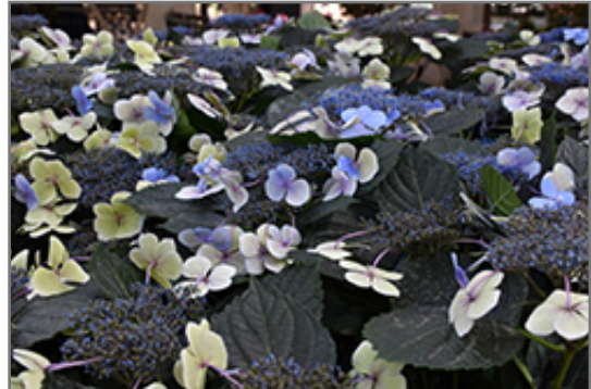
Tokyo Delight Hydrangea flowers

Tokyo Delight Hydrangea is recommended for the following landscape applications;