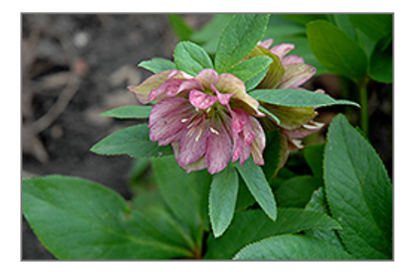
Heronswood Double Pink Hellebore flowers