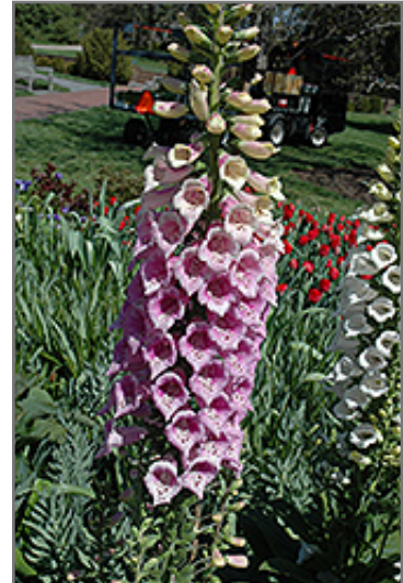
Excelsior Pink Foxglove flowers

Excelsior Pink Foxglove is recommended for the following landscape applications;