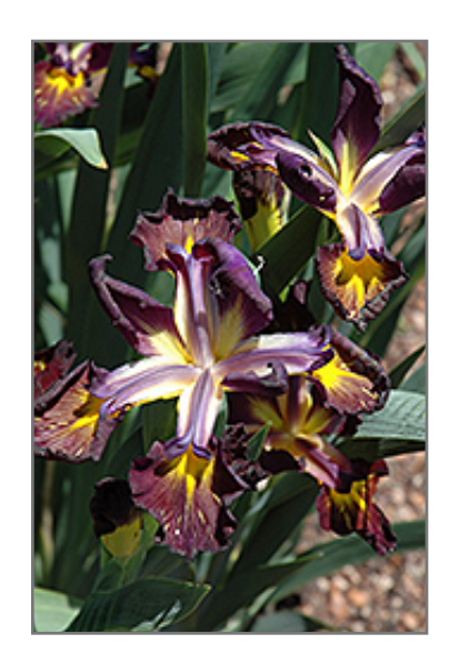
Missouri Iron Ore Iris flowers

Plant Height: 32 inches Flower Height: 4 feet Spread: 28 inches Spacing: 24 inches Sunlight: O O Hardiness Zone: 4a Group/Class: Spuria Iris Description: