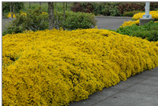
Lydia Woadwaxen in bloom