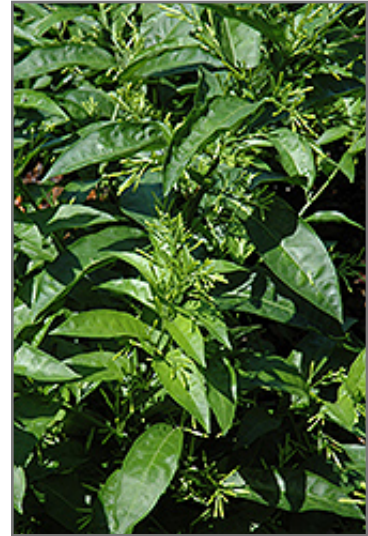
Night Blooming Jessamine flowers