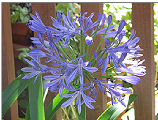
Peter Pan Agapanthus flowers

This plant will require occasional maintenance and upkeep, and is best cleaned up in early spring before it resumes active growth for the season. It is a good choice for attracting bees and butterflies to your yard. It has no significant negative characteristics.