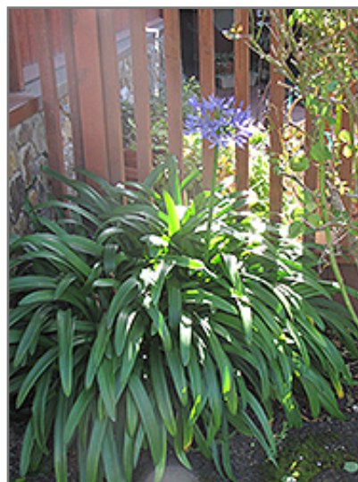
Peter Pan Agapanthus