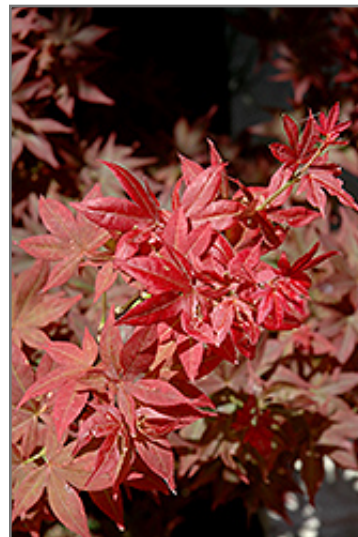
Ruby Stars Japanese Maple foliage

Ruby Stars Japanese Maple is recommended for the following landscape applications;