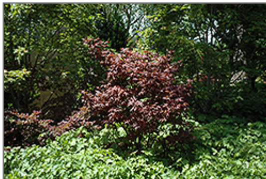
Ruby Ridge Japanese Maple