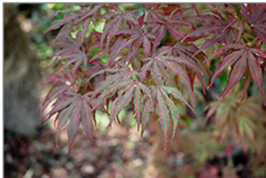
Mikazuki Japanese Maple foliage

Mikazuki Japanese Maple is recommended for the following landscape applications;