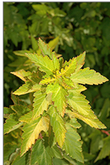
Lemon Candy Ninebark foliage

Lemon Candy Ninebark is recommended for the following landscape applications;