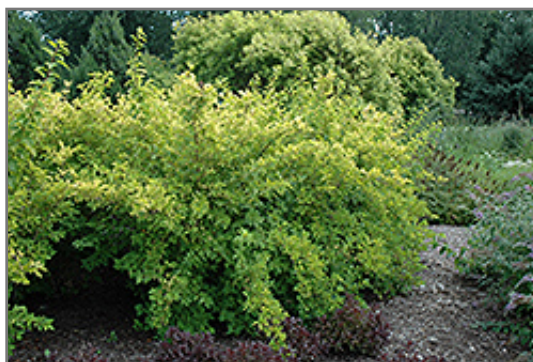
Lemon Candy Ninebark