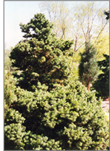
Green Globe Alpine Fir

Green Globe Alpine Fir will grow to be about 12 feet tall at maturity, with a spread of 10 feet. It tends to fill out right to the ground and therefore doesn't necessarily require facer plants in front, and is suitable for planting under power lines. It grows at a slow rate, and under ideal conditions can be expected to live to a ripe old age of 100 years or more; think of this as a heritage shrub for future generations!