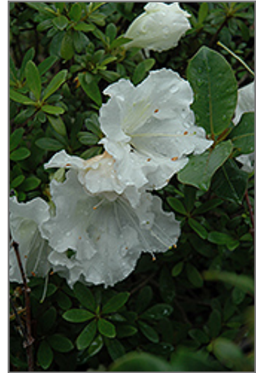
Gumpo White Azalea flowers

Gumpo White Azalea will grow to be about 24 inches tall at maturity, with a spread of 3 feet. It tends to be a little leggy, with a typical clearance of 1 foot from the ground. It grows at a slow rate, and under ideal conditions can be expected to live for 40 years or more.