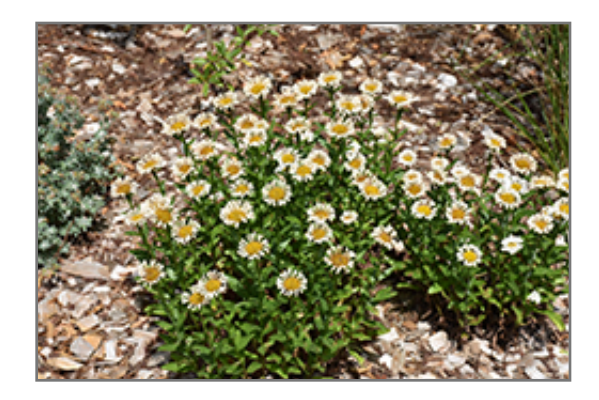
Lacrosse Shasta Daisy in bloom