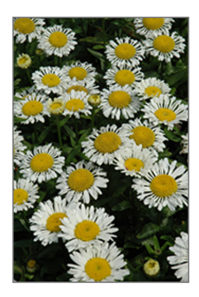
Lacrosse Shasta Daisy flowers

This plant will require occasional maintenance and upkeep. Trim off the flower heads after they fade and die to encourage more blooms late into the season. It is a good choice for attracting butterflies to your yard. Gardeners should be aware of the following characteristic(s) that may warrant special consideration;