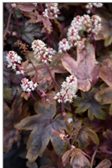
Brass Lantern Foamy Bells flowers