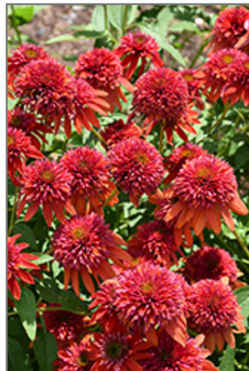
Double Scoop Orangeberry Coneflower flowers

Double Scoop Orangeberry Coneflower is recommended for the following landscape applications;