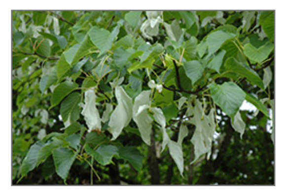
Dove Tree foliage

This tree should only be grown in full sunlight. It prefers to grow in average to moist conditions, and shouldn't be allowed to dry out. It is not particular as to soil type or pH. It is somewhat tolerant of urban pollution. This species is not originally from North America.