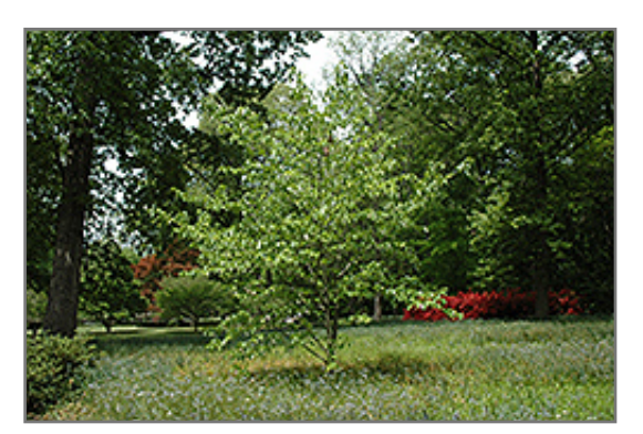
Dove Tree

Dove Tree is recommended for the following landscape applications;