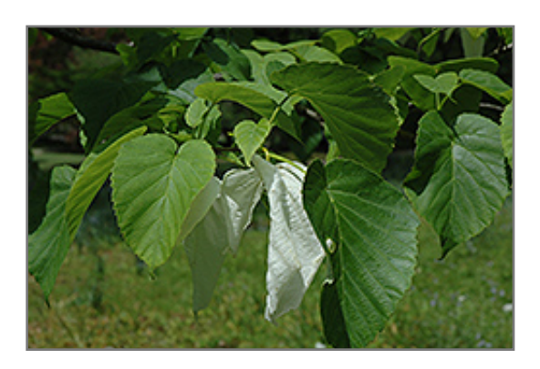
Dove Tree flowers

An exotic deciduous tree that is broadly pyramidal in habit when young; small reddish-purple flowers in spring have large white bracts that are visually stunning, giving the tree its common names; may not flower for first ten years