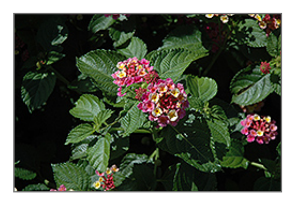
Patriot Classic Passion Lantana flowers