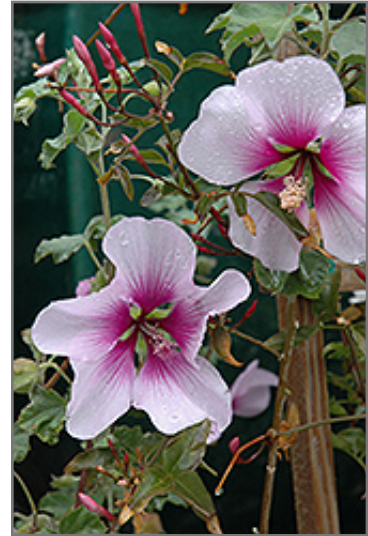
Tree Mallow flowers