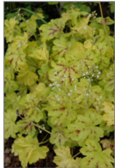
Solar Power Foamy Bells flowers