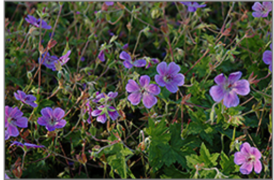
Rainbow Cranesbill flowers