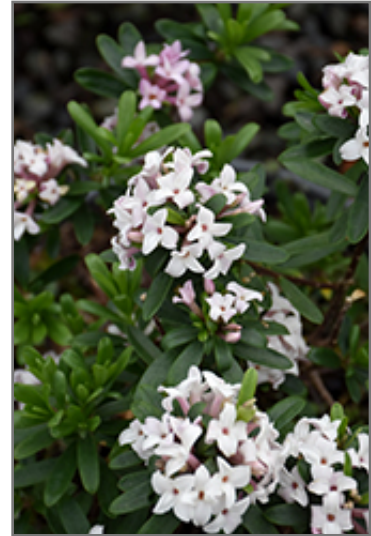
Eternal Fragrance Daphne flowers