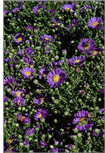
Daydream Aster flowers