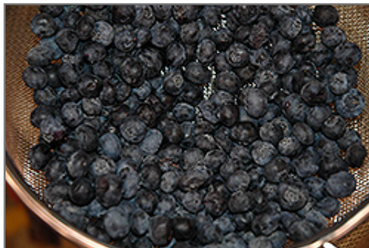
Brigitta Blueberry fruit

Brigitta Blueberry features dainty clusters of white bell-shaped flowers with shell pink overtones hanging below the branches in mid spring. It has green deciduous foliage which emerges coppery-bronze in spring. The glossy oval leaves turn an outstanding burgundy in the fall. It features an abundance of magnificent blue berries from mid to late summer. The smooth yellow bark adds an interesting dimension to the landscape.