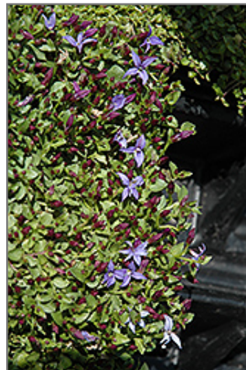
County Park Star Creeper flowers