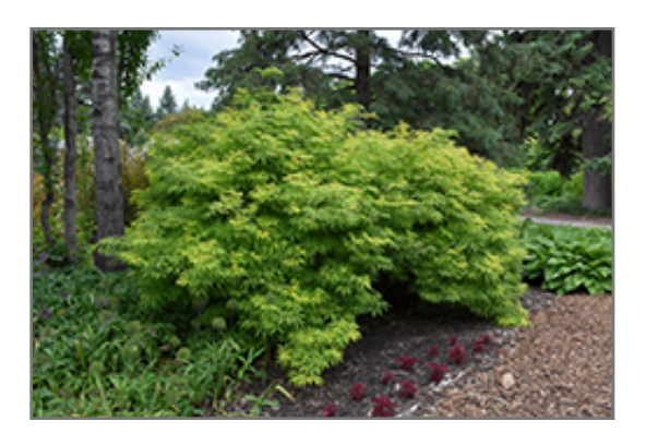
Sutherland Gold Elder

Sutherland Gold Elder is a dense multi-stemmed deciduous shrub with an upright spreading habit of growth. Its relatively fine texture sets it apart from other landscape plants with less refined foliage.