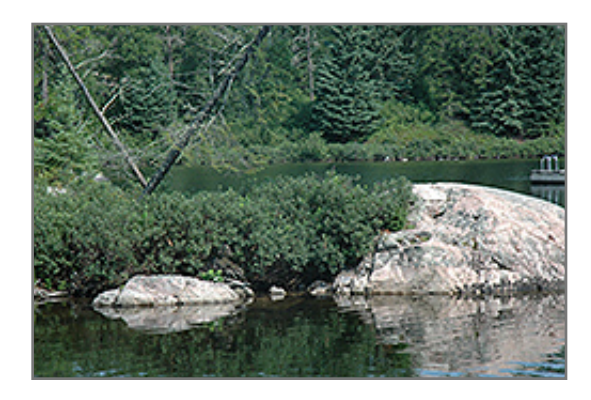
Sweet Gale