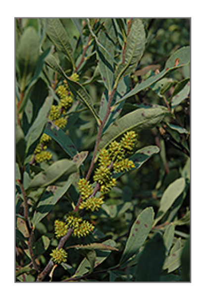
Sweet Gale flowers

This shrub will require occasional maintenance and upkeep, and may require the occasional pruning to look its best. It is a good choice for attracting birds, bees and butterflies to your yard. Gardeners should be aware of the following characteristic(s) that may warrant special consideration;