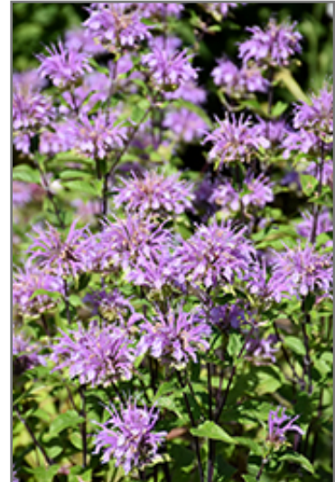
Blue Stocking Beebalm flowers