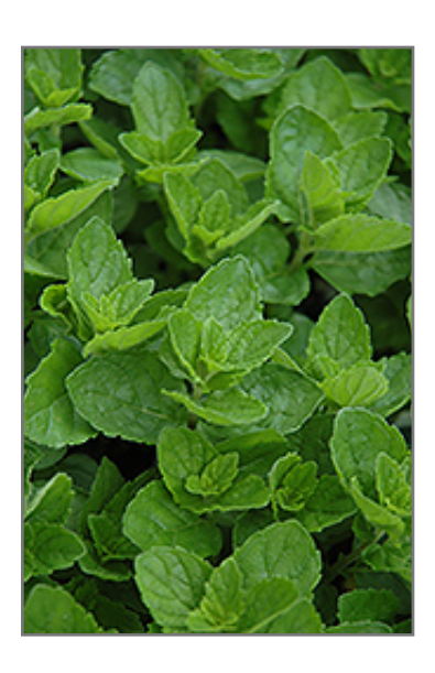
Spearmint foliage

This is an herbaceous perennial herb with a spreading, ground-hugging habit of growth. Its medium texture blends into the garden, but can always be balanced by a couple of finer or coarser plants for an effective composition. This is a high maintenance plant that will require regular care and upkeep, and should be cut back in late fall in preparation for winter. It is a good choice for attracting bees and butterflies to your yard, but is not particularly attractive to deer who tend to leave it alone in favor of tastier treats. Gardeners should be aware of the following characteristic(s) that may warrant special consideration: