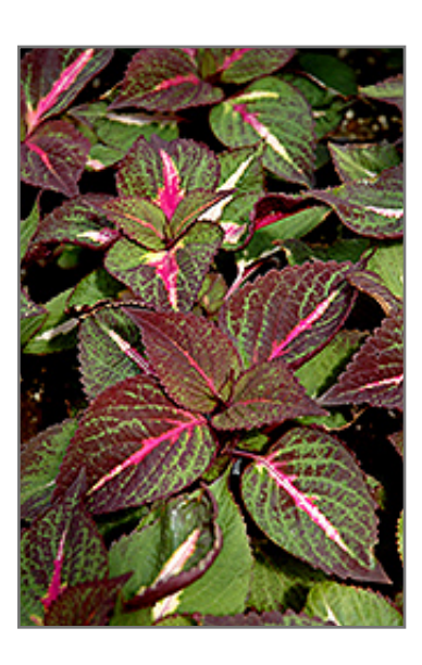
Magilla Perilla foliage