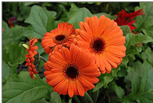
Orange Gerbera Daisy flowers

Orange Gerbera Daisy is recommended for the following landscape applications;