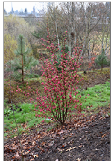
King Edward VII Winter Currant in bloom