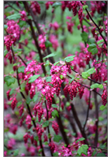
King Edward VII Winter Currant flowers