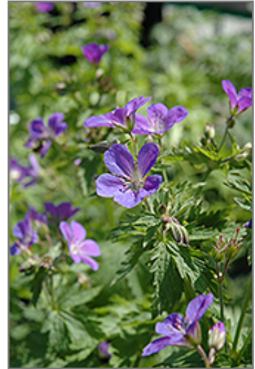
Mayflower Cranesbill flowers