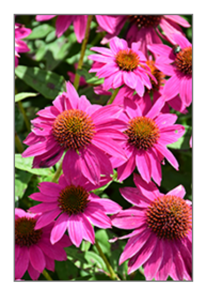
Sombrero Hot Pink Coneflower flowers

Sombrero Hot Pink Coneflower is recommended for the following landscape applications;