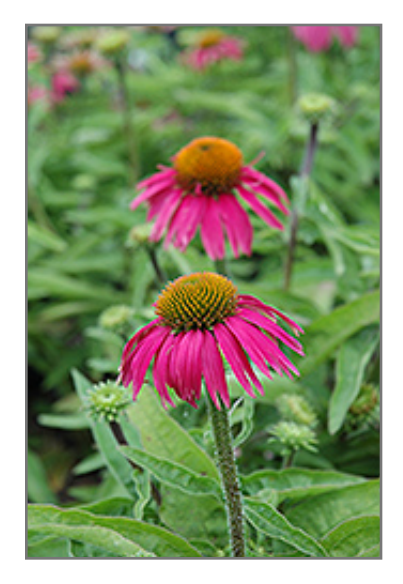
Sombrero Hot Pink Coneflower flowers