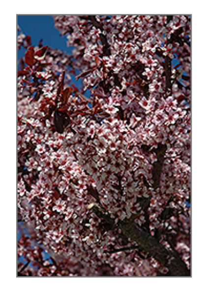
Thundercloud Plum flowers