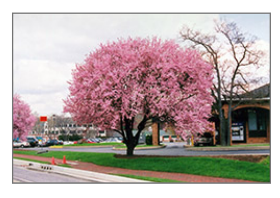
Thundercloud Plum in bloom

A stunning accent tree that resembles a cloud of fragrant pink flowers in spring, deep purple foliage all season long; makes a bold statement in the landscape, best used as a solitary feature tree or in street plantings