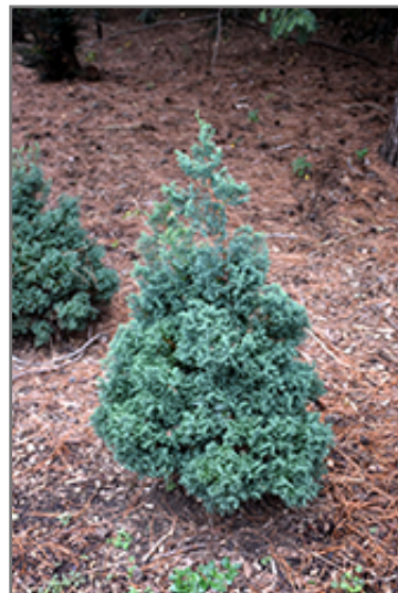
Blue Feathers Hinoki Falsecypress

This shrub does best in full sun to partial shade. It prefers to grow in average to moist conditions, and shouldn't be allowed to dry out. It is not particular as to soil type or pH. It is highly tolerant of urban pollution and will even thrive in inner city environments, and will benefit from being planted in a relatively sheltered location. Consider applying a thick mulch around the root zone in winter to protect it in exposed locations or colder microclimates. This is a selected variety of a species not originally from North America.