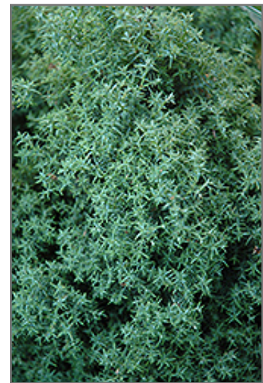
Blue Feathers Hinoki Falsecypress foliage