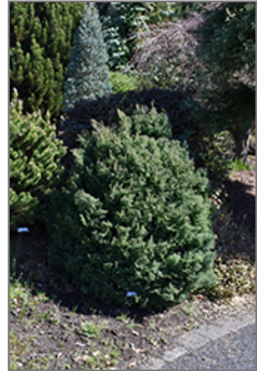
Blue Feathers Hinoki Falsecypress

Blue Feathers Hinoki Falsecypress is recommended for the following landscape applications;