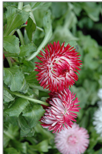
Enorma Red English Daisy flowers

Enorma Red English Daisy is recommended for the following landscape applications;