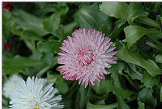
Enorma Pink English Daisy flowers

Enorma Pink English Daisy is recommended for the following landscape applications;