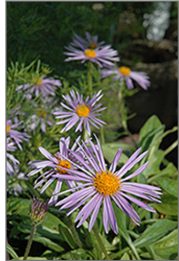
Triumph Aster flowers