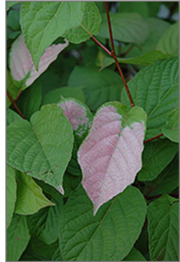
September Sun Kiwi foliage

This is a relatively low maintenance woody vine, and is best pruned in late winter once the threat of extreme cold has passed. It has no significant negative characteristics.