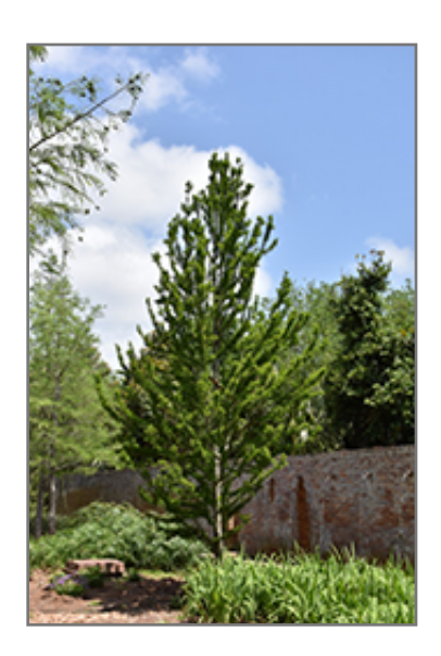
Peve Minaret Baldcypress