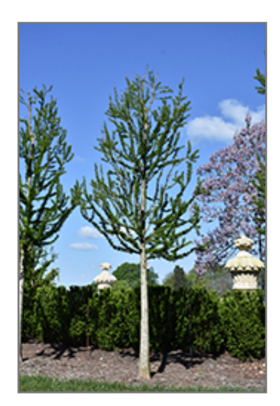
Peve Minaret Baldcypress