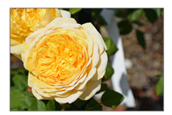
Charles Darwin Rose flowers

Charles Darwin Rose is recommended for the following landscape applications;