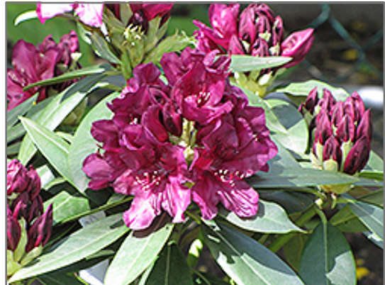
Polar Night Rhododendron flowers