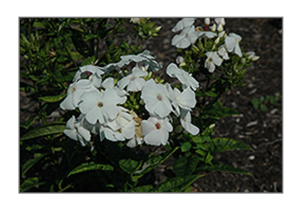
Pina Colada Garden Phlox flowers