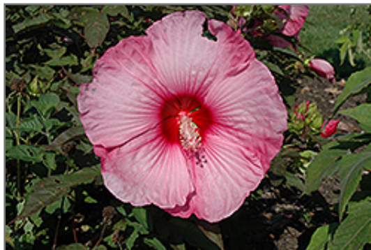
Stardust Hibiscus flowers

Other Names: Rose Mallow, Hardy Hibiscus