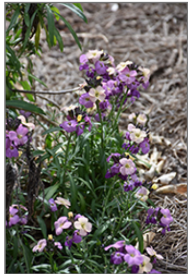
Poem Pastel Wallflower flowers