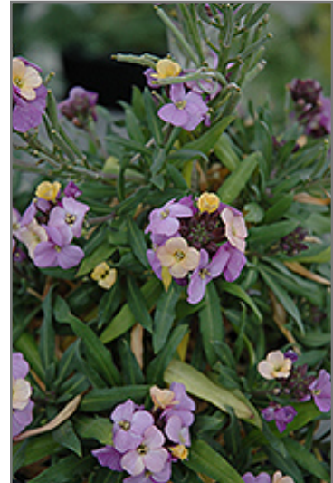
Poem Pastel Wallflower flowers

Poem Pastel Wallflower is recommended for the following landscape applications;