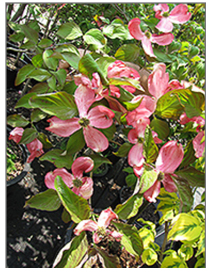
Cherokee Sunset Flowering Dogwood flowers