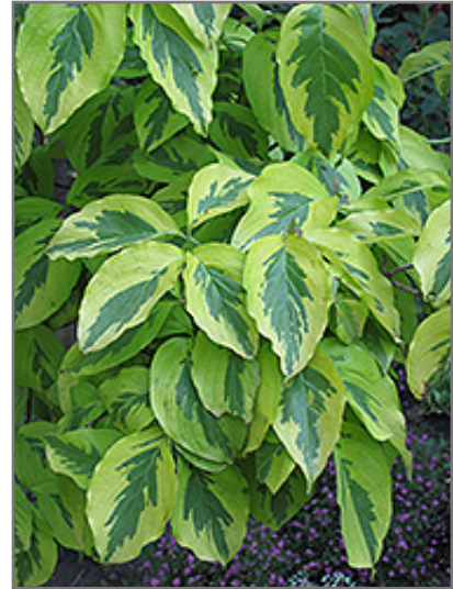
Cherokee Sunset Flowering Dogwood foliage