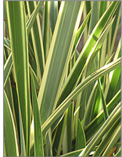
Wings of Gold New Zealand Flax foliage