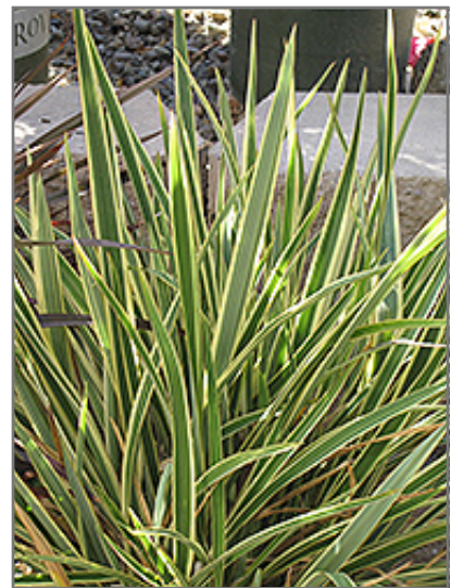
Wings of Gold New Zealand Flax