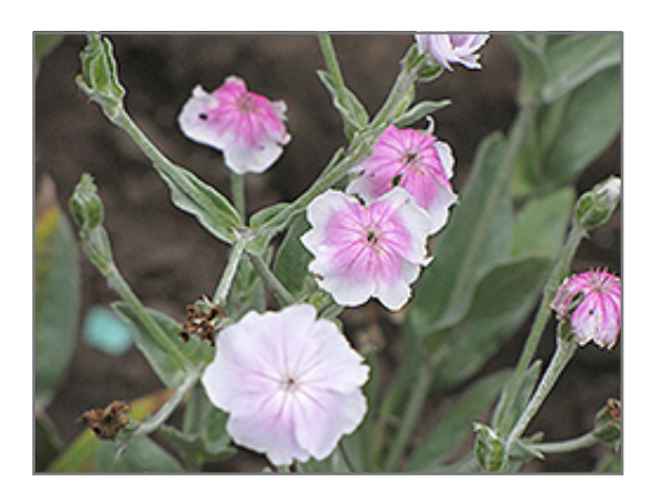
Angel's Blush Rose Campion flowers